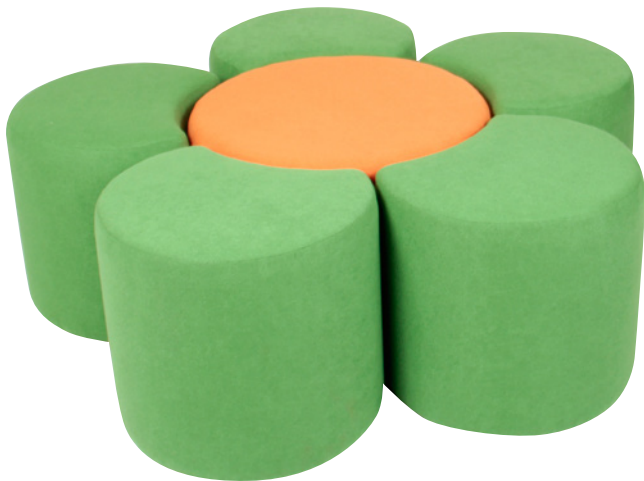
FLOWER OTTOMAN SET