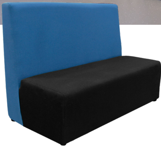
BOOTH LOUNGE (LINEAR)