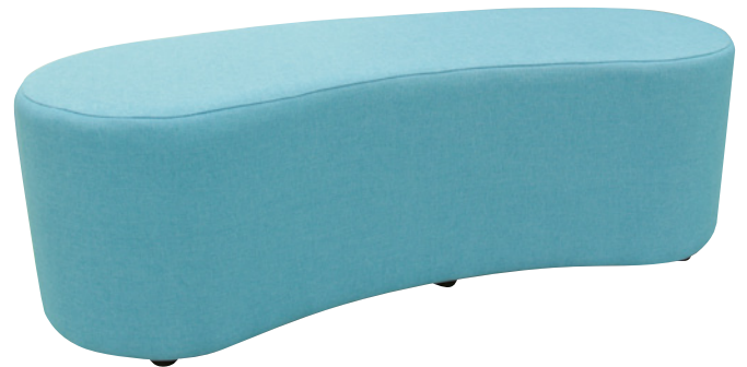
JELLY BEAN OTTOMAN